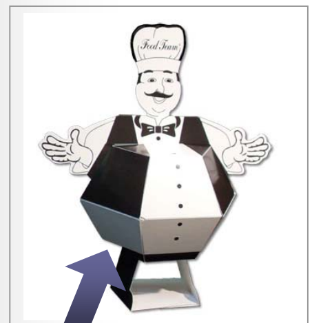
... an action-driving Pop-Up to the core! Tuck special tickets, tokens, coins, even sample menus or product specs inside, then invite customers online (or in-store) for expanded content or savings coupons.

Add a little "character" to your sales and marketing promotions! The addition of arms, legs and a whimsical "head" transforms your Pop-Up into an industry-themed "Pop-Up Person" who can conceal raffle tickets, entry coupons, or online keycodes inside a 3D "tummy." Guaranteed to provoke a chuckle and get displayed on a desktop, Pop-Up People are ideal for driving online and event traffic; promoting a new product; or making a special announcement. Each folds perfectly flat for easy mailing, then springs open to introduce your message in a uniquely entertaining way.